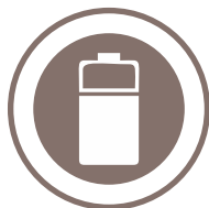
Internal Battery Backup