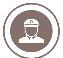
Driving Behaviour by OBD (BLE)