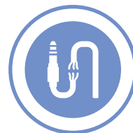
1-Wire Protocol Support