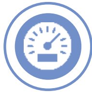
Over Speed Alert