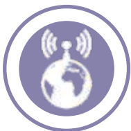
2 Way Communication Over Bluetooth